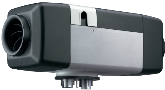
Air Top 2000 ST Air Heater Optional SmarTemp Control 2.0 available! Ask for details!